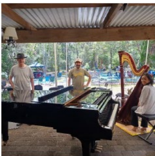
The piano was installed then needed to be moved 'just another step to the right.'